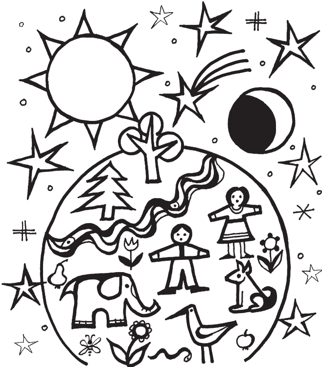
from Psalm 8