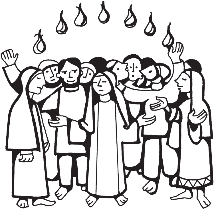
from Acts 2