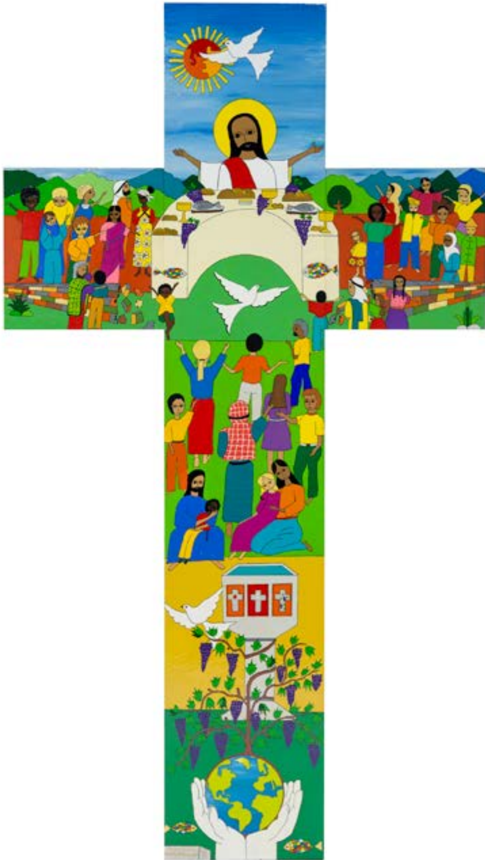
The Salvadoran cross, commissioned by artist Christian Chavarria Ayala for the Joint Commemoration of the Reformation, was carried in the procession at the beginning of the service. The cross depicts the triune God's creative, reconciling, and sanctifying work. Image: LWF/Christian Chavarria. Used by permission. All rights reserved. Permission is granted for congregations to reproduce this page provided copies are for local use only and the following copyright notice appears: From Declaration on the Way Study Guide , copyright © 2017 Evangelical Lutheran Church in America.