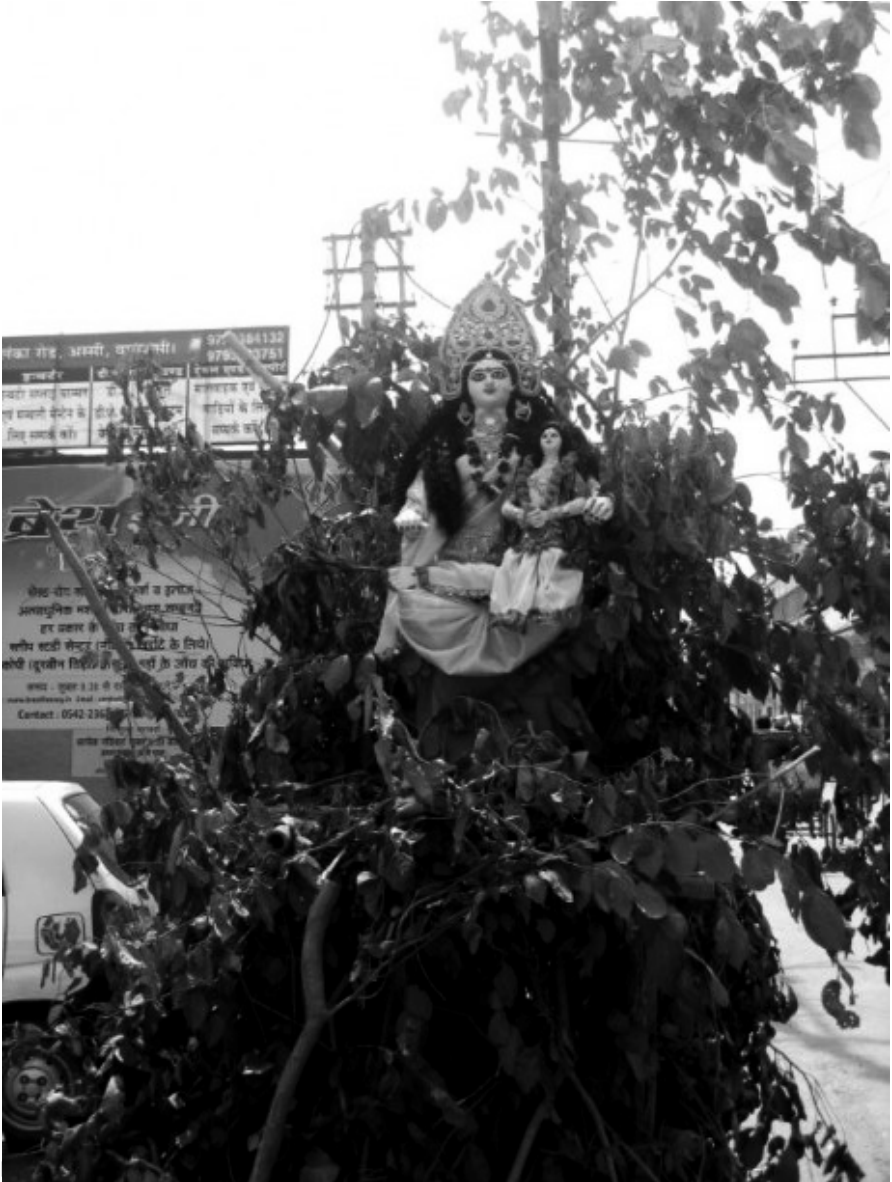
Figure 1.5. A woodpile with images of Holika and Prahlad, Varanasi, India, March 2012