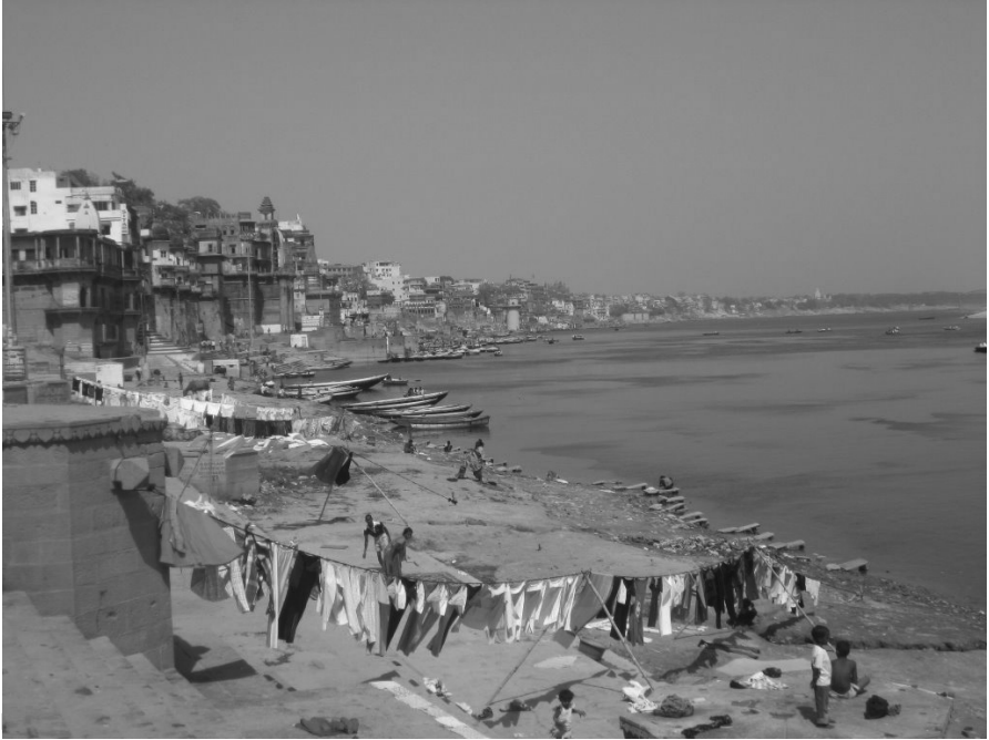
Figure 1.1. On the banks of the Ganges, Varanasi, India, March 2012

By design, I began writing this chapter in a particularly auspicious place: sitting on the roof of my hotel in Varanasi, India, looking out over the Ganges River.