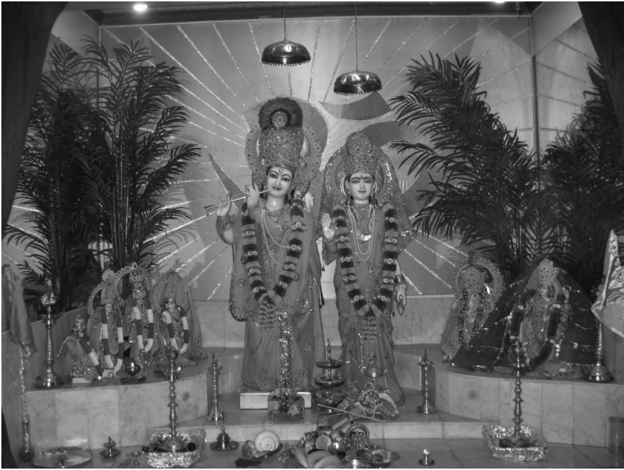
Figure 1.2. Images of Rama and Sita from the Hindu Temple and Cultural Center, Columbia, SC.

relationships, they demonstrate ideal social behavior. Thus, people today still model their own behavior on that of Rama and Sita. 23