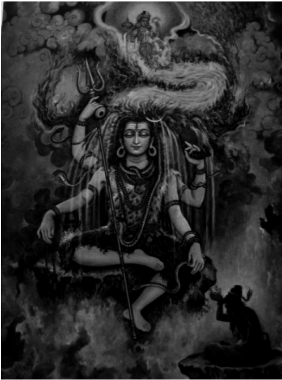
Figure 1.3. A mass-produced image of the god Shiva. The Ganges River, personified as a goddess, descends to the earth, as Shiva first absorbs the weight of her descent in his hair.

Without a doubt, the answer to this question is “yes”—and more specifically, an emphatic, exuberant, multifaceted yes. But at the same time, that “yes” cannot at all be interpreted in the way Christians typically understand either the question