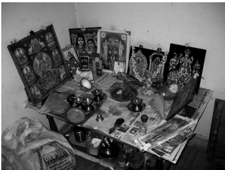
Figure 1.6. A modest home altar in Hyderabad, India, March 2012

small altars at home on which they place pictures and/or statues representing different deities, including those to whom the family is particularly devoted. (These are called ishtadevatas , one's personal god.) Each morning, one member of the family, usually the father or the mother, will perform a short puja at the altar. This may include saying prayers, lighting a lamp, burning incense, making offerings of fruit and flowers, and ringing a bell. The goal in this worship is to please the gods through all five senses—hence the incense, colored lights (this is the reason you often find Christmas lights hanging in American Hindu temples year round), bell and/or music, and food. The same thing happens in temples, although the rituals are much more elaborate there, and are done at various times throughout the day. This is because in a temple, the deity is believed to inhabit the images full-time, not just merely when invited to be present, which is what happens in a home puja: the deity is invoked, worshiped, and then the divine presence withdraws.