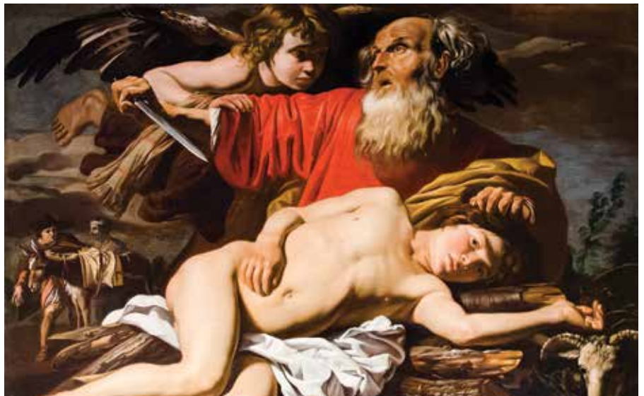
LE SACRIFICE D'ISAAC, MATTHIAS STOM