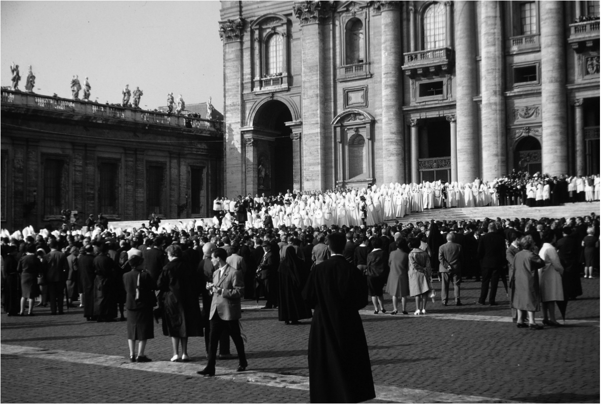
Fig. 1.1. The start of the Second Vatican Council, 1962.

The Second Vatican Council, convoked by Pope John XXIII (1958–1963) and concluded by Pope Paul VI (1963–1978), provided the foundations for a philosophical social ethics based on the concept of “liberation of the oppressed”—that is, the struggle for the material and educational conditions that would allow for vast sectors of the world population to overcome economic misery.