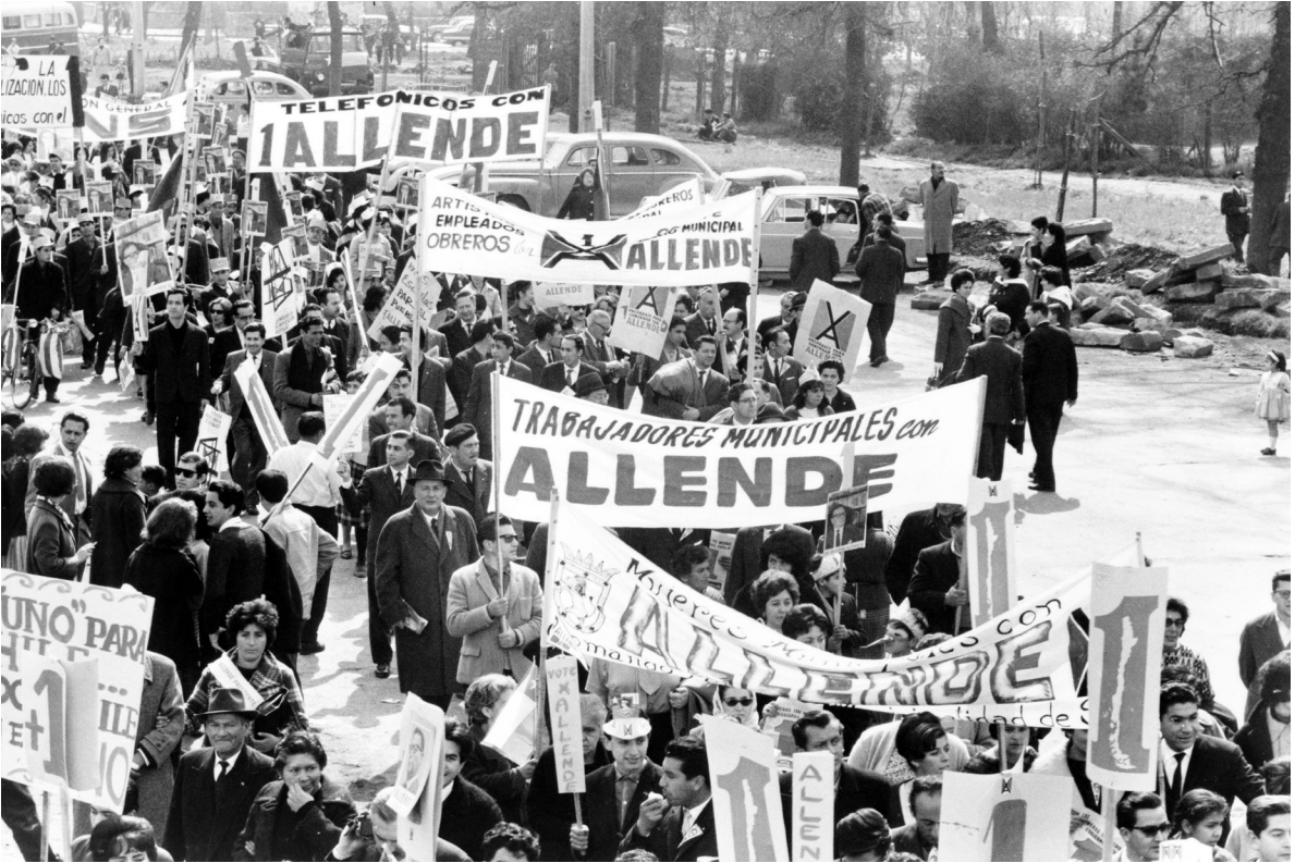
Fig. 1.2. Marchers for Salvador Allende. A crowd of people marching to support the election of Salvador Allende for president in Santiago, Chile, September 5, 1964.

toward life did not change as much as Aymaran and Incan knowledge and attitude toward life.