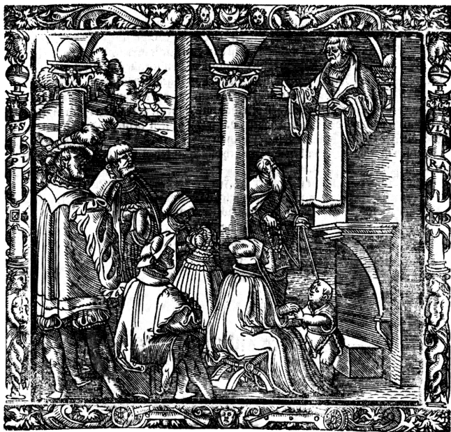
Hans Brosamer, Martin Luther in the Pulpit , woodcut.

Church in Wittenberg in 1517. They were written in Latin, the academic language of the day, and were intended to provoke a debate within the university. They did much more than that. Within months, remarkably fast by sixteenth-century standards, they were translated into German and distributed throughout the cities and universities of northern Europe. 17 Suddenly, Luther no longer was an obscure monk teaching in a backwater Saxon university. His name was now on the minds and lips of the day's leading theologians, scholars, and church people.