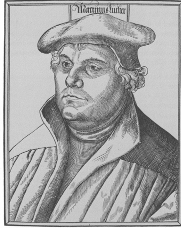
Hans Brosamer, Martin Luther , 1530, woodcut. Schlossmuseum, Gotha.