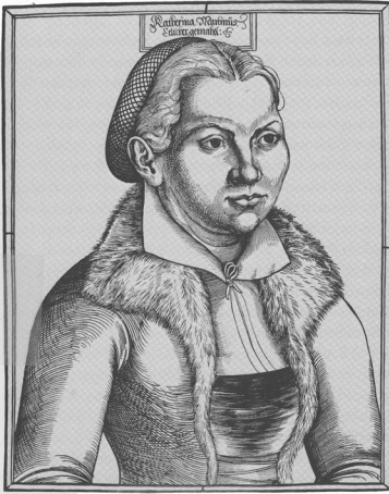
Hans Brosamer, Katherine von Bora , 1530, woodcut. Schlossmuseum, Gotha.