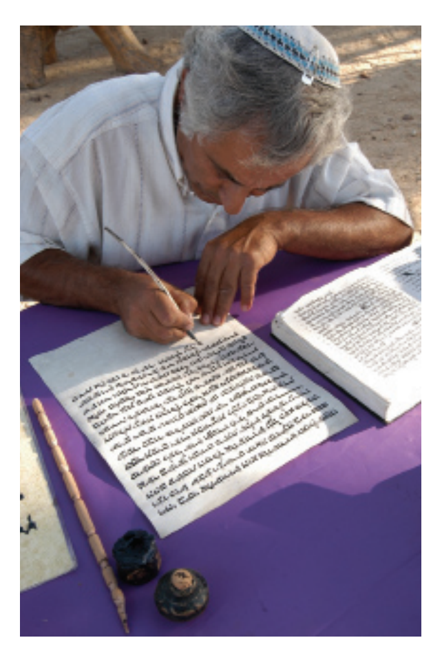
A modern-day scribe copying the Torah.

essentially an edited anthology, a collection of writings by different people and from different ages. Nobody ever sat down to gather the New Testament into one unified collection: it just arose spontaneously from the reading habits of the early church. But somebody did set out to edit and organize the books of the Old Testament, to form a coherent account of the life of ancient Israel. In fact, more than one person or group of people did so. The earliest editions of these materials were probably collected during the reigns of David and Solomon, who provided the stability and economic prosperity necessary for the flourishing of such an enterprise. It was natural for people to begin at this time to take a keen interest in their past, revisiting the stories of their forebears as a way of identifying and celebrating their emerging national consciousness. Before that they no doubt had their own tribal histories which had been preserved and handed on by word of mouth from one generation