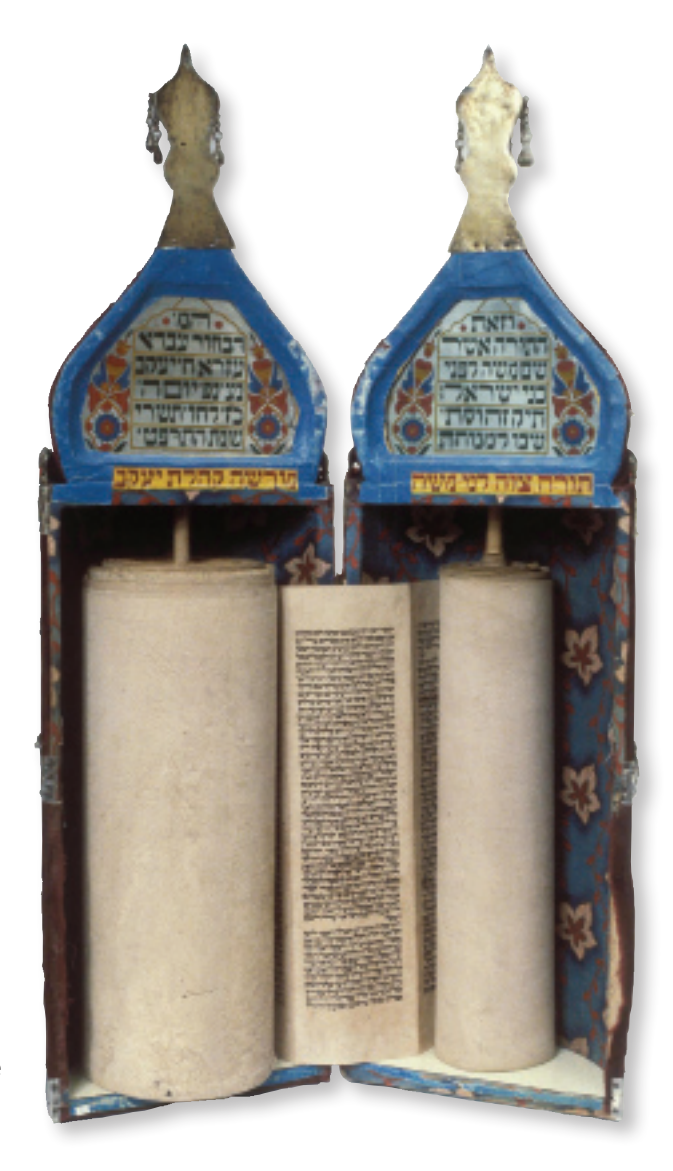
The Torah is highly revered even today. This ornamental case originated in Iraq in the 19th century AD.

Western democracy, the laws of the Hebrew Bible (contained mostly in the books of Exodus, Leviticus, and Numbers) can seem harsh and unreasonable. But the ancient people of Israel never regarded them in that way, and though Yahweh (the personal name of God) was to be honoured and respected, keeping the Law was never regarded as a burden. On the contrary, it was something to be observed with joy, for the people looked back beyond the smoke and fire of Sinai to the events that preceded it, and they could see that God's Law was based on God's love, and their obedience was the free and loving devotion of those who were grateful for unexpected and undeserved benefits. It is no coincidence that the Ten Commandments begin not with an instruction, but with a reminder of God's love and goodness: "I am Yahweh your God who brought you out of Egypt, where you were slaves ..." (Exodus 20:2).